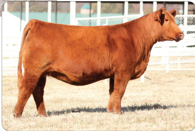
DAM: PBRS Ruby Red 8214