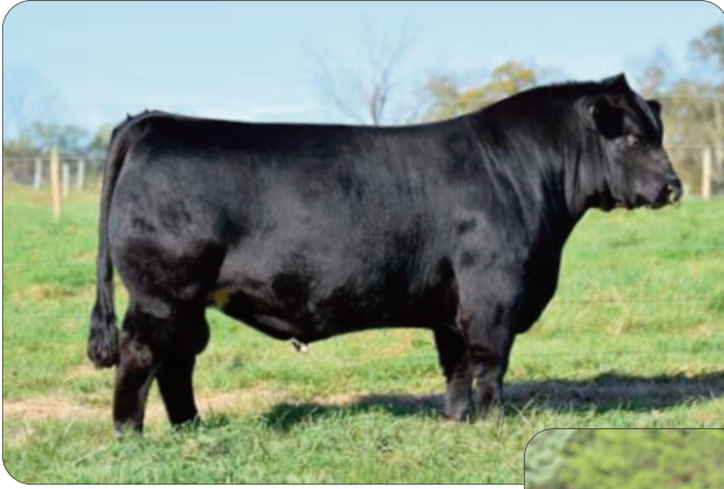
SIRE: CJSL Dauntless 6257D