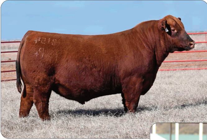
SIRE: DUFF Red Bear 18154