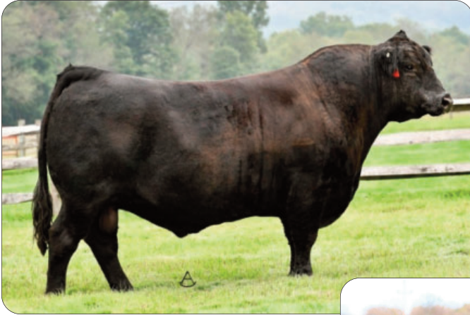
SIRE: CJSL Creed 5042C