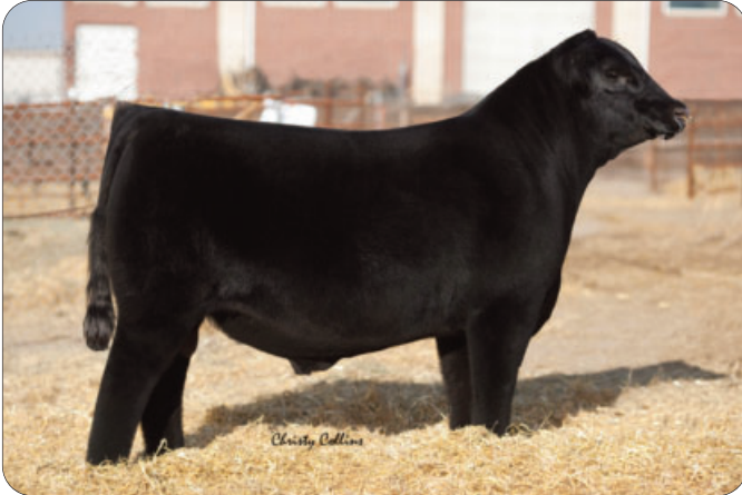
SIRE: Silveiras Style 9303