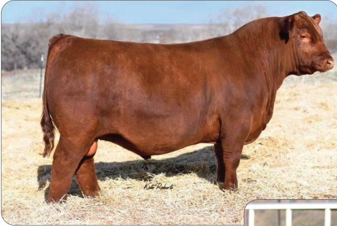
SIRE: RED U2 Township 17G