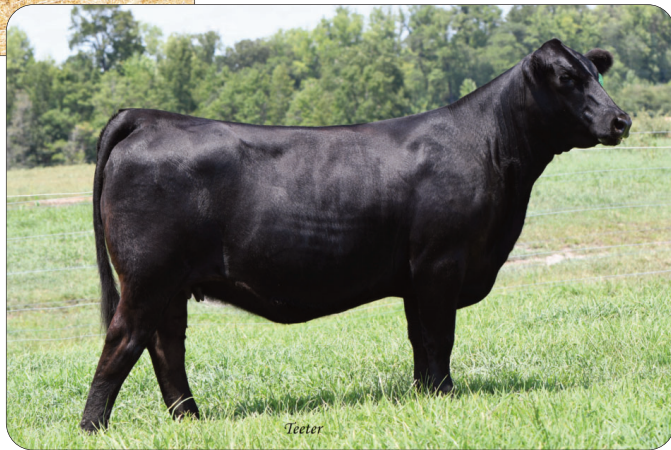
DAM: ELCX Empress 752E