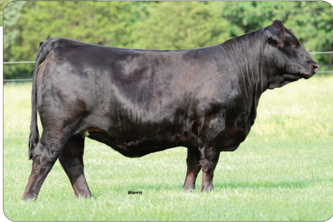
DAM: AUTO Fedora 222F