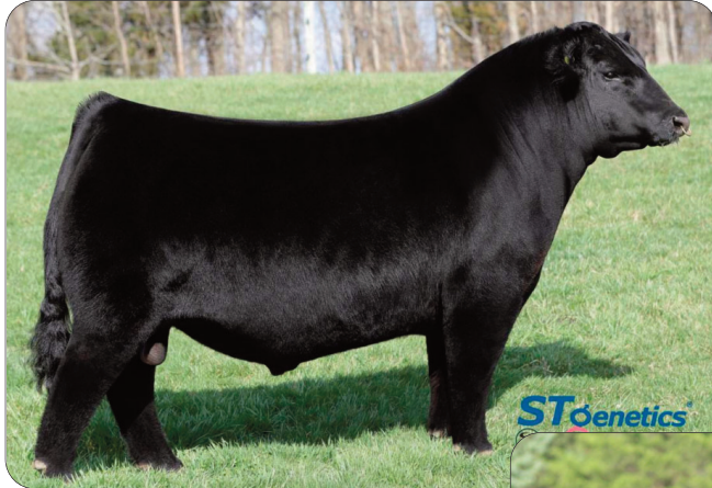
SIRE: Conley Dieckmann Prowess