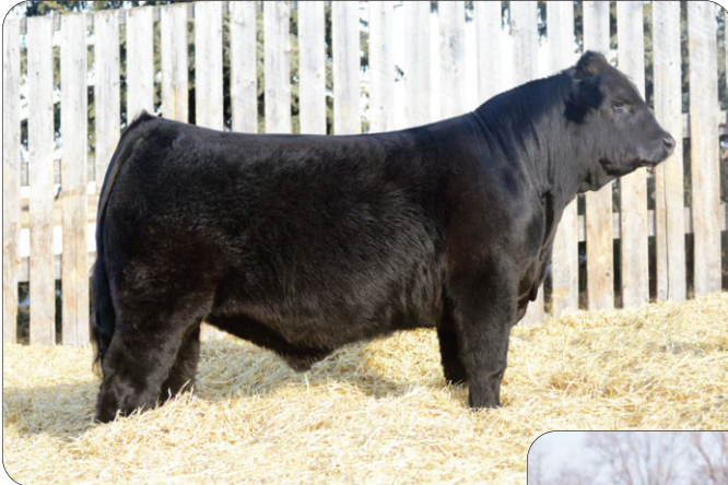
SIRE: Riverstone Crown Royal