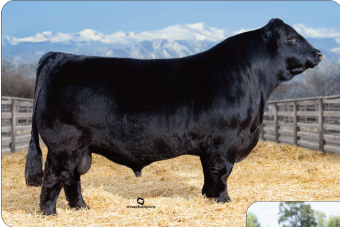
SIRE: ELCX Kings Landing 599D