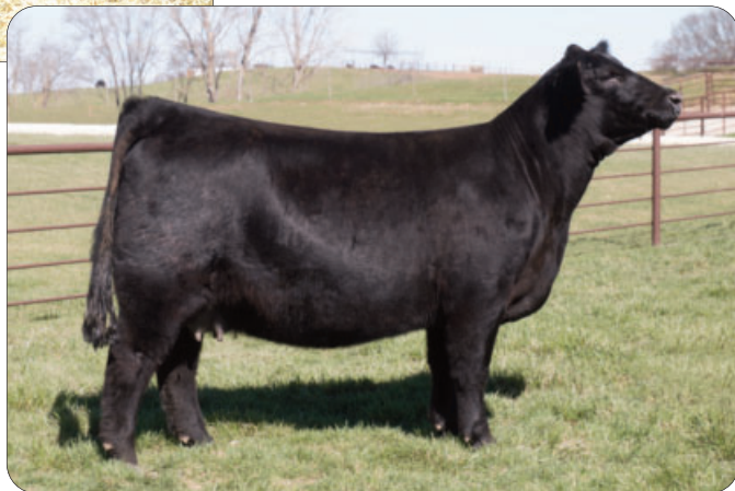
DAM: AUTO Casper C ET